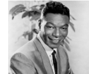
Nat King Cole

1. Singer, songwriter, and pianist who was the first African American to host a national television show.