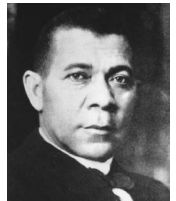
Booker T. Washington

4. Inventor whose high quality industrial inventions were the basis for the expression "The real McCoy".